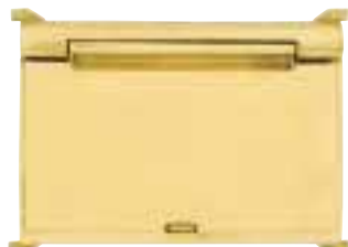
Large Letter Plate – Back ■ 3051