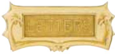
Edwardian Postal Knocker ■ 0681