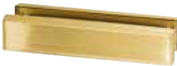
Letter Flap – Front and Back ■ 3035