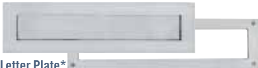
Letter Plate* ■ ■ 3036 Letter Plate Trim* ■ ■ 3036T *Sold separately