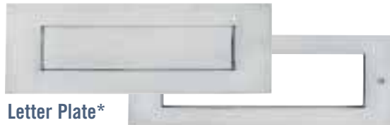
Letter Plate* ■ ■ 3026 *Sold separately Letter Plate Trim* ■ ■ 3026T