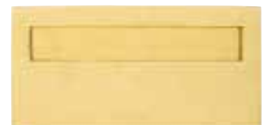
Letter Plate ■ 3039