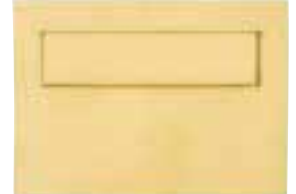
Letter Plate ■ 3040