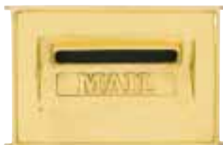
Large Letter Plate – Front ■ 3050