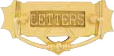
Victorian Postal Knocker ■ 0682