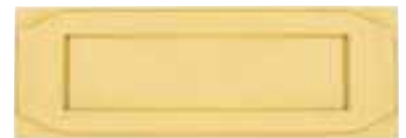
Art Deco Letter Flap ■ 6051