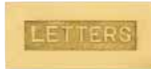
Letter Flap ■ 3028