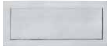
Letter Flap ■ ■ 3038