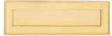
Edged Letter Flap ■ 1409