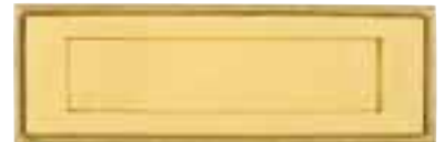
Georgian Letter Plate ■ 2015