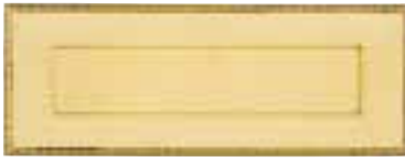
Regency Letter Plate ■ 0904